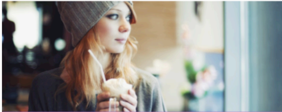
Millennials embracing natural family planning options and fertility tracking technology